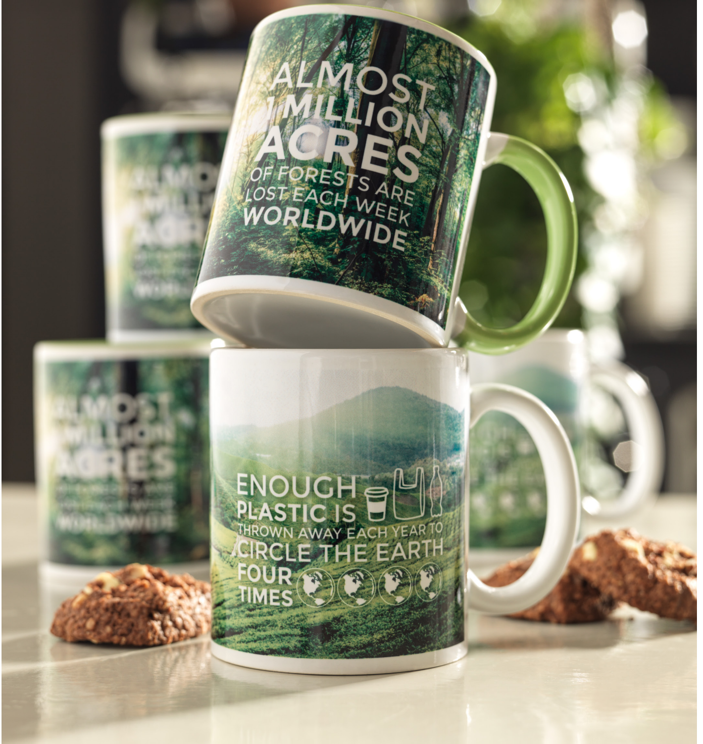
100377 PIX 330 ML CERAMIC SUBLIMATION MUG