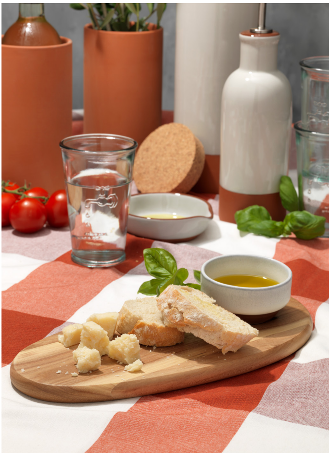
112974 BOLTON BRUSCHETTA SERVING BOARD