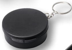
100573 RHINE REUSABLE SILICONE STRAW KEY- CHAIN