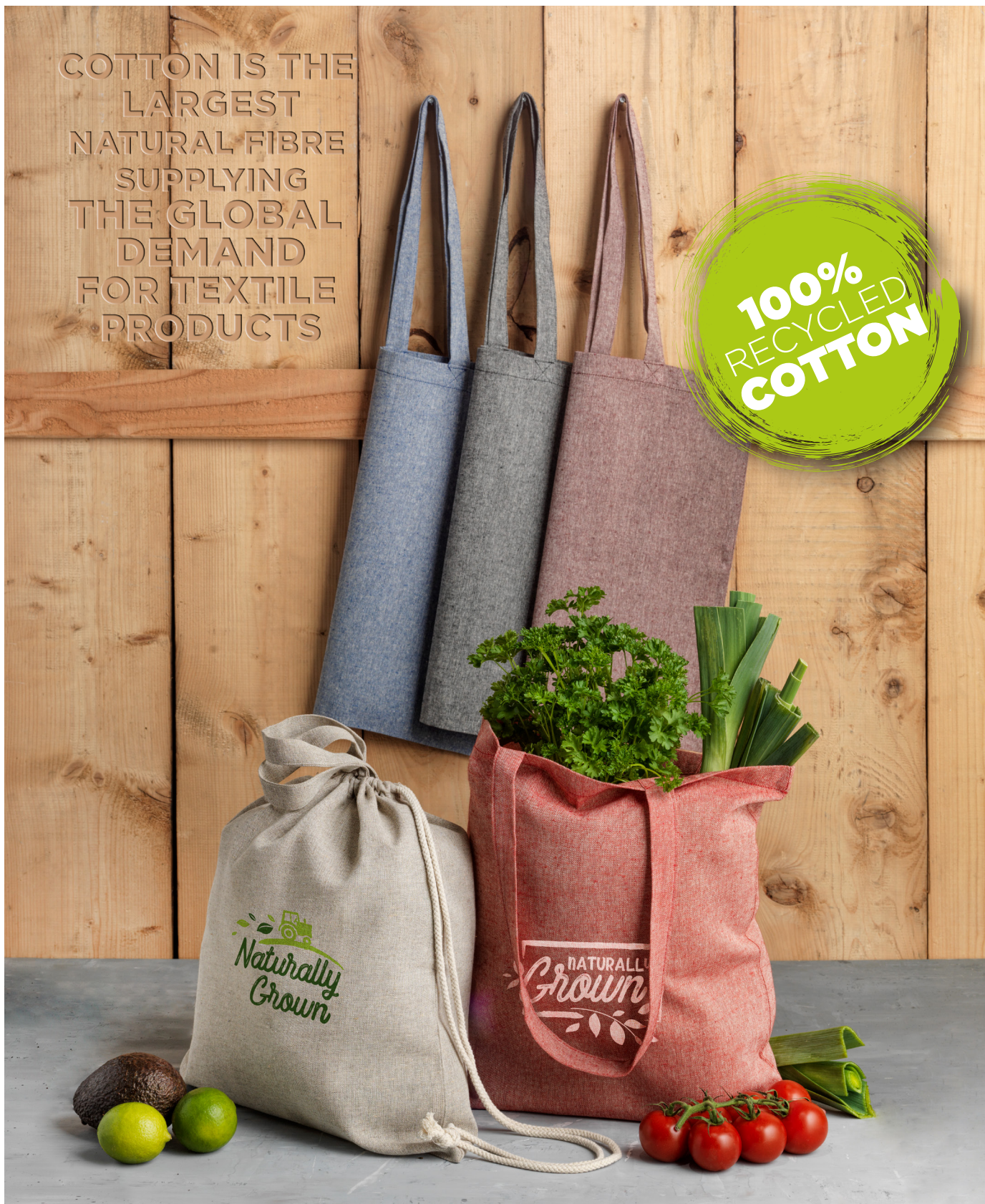
120459 PHEEBS 150 G/M 2 RECYCLED COTTON DRAWSTRING BAG