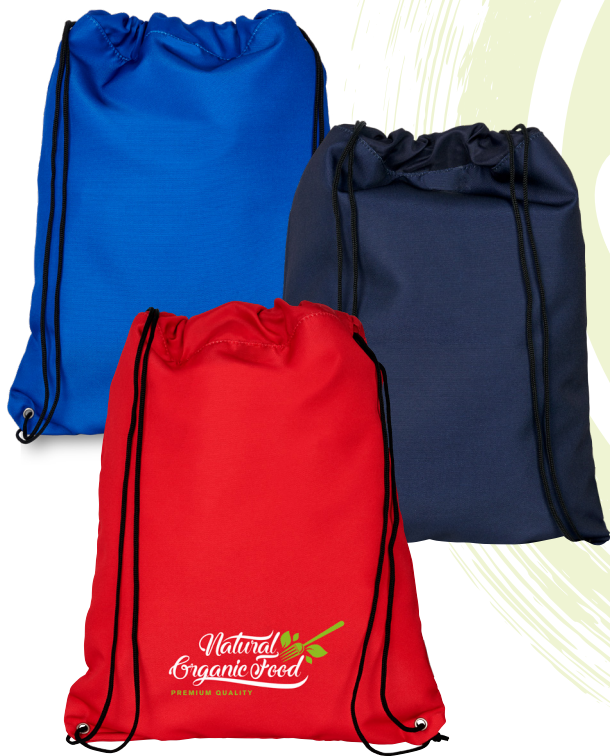
120461 ORIOLE RPET DRAWSTRING BAG