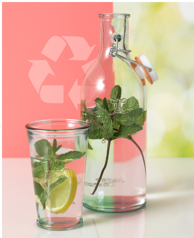
112271 RECYCLED CARAFE WITH GLASS