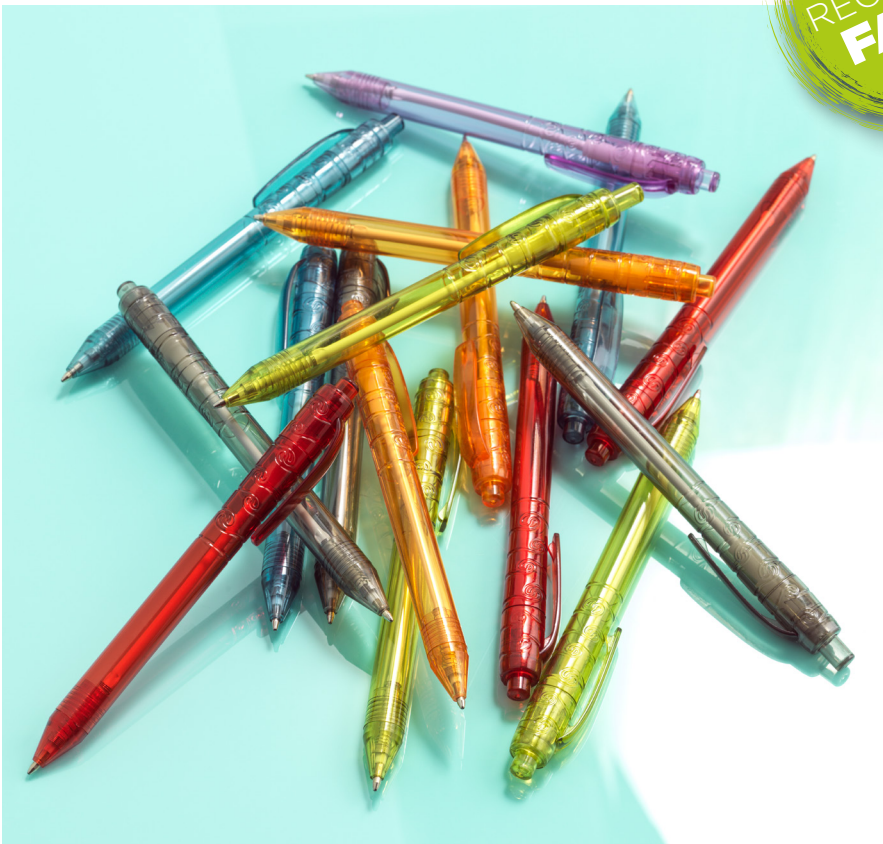
106578 VANCOUVER RECYCLED PET BALLPOINT PEN