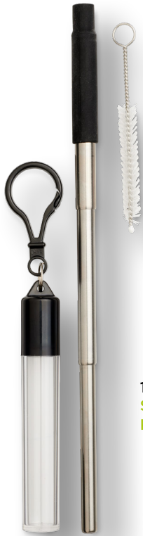
100586 ZEYA REUSABLE STAINLESS STEEL STRAW KEYCHAIN

MOST GLASS IS 100% RECYCLABLE AND CAN BE RECYCLED ENDLESSLY WITHOUT LOSS IN QUALITY OR PURITY