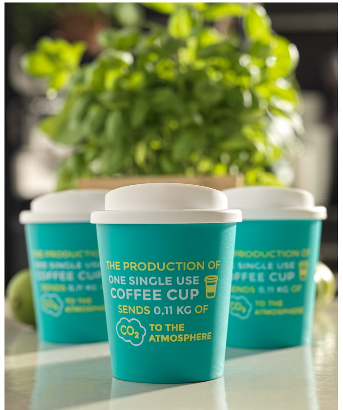
210092 AMERICANO® ESPRESSO 250 ML INSULATED TUMBLER