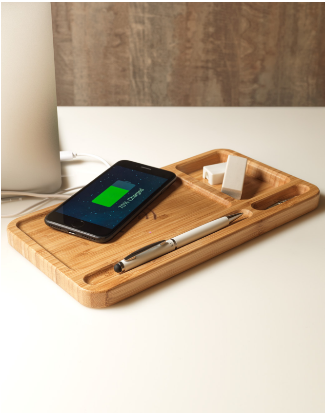
124102 FRAME WIRELESS CHARGING DESK ORGANISER