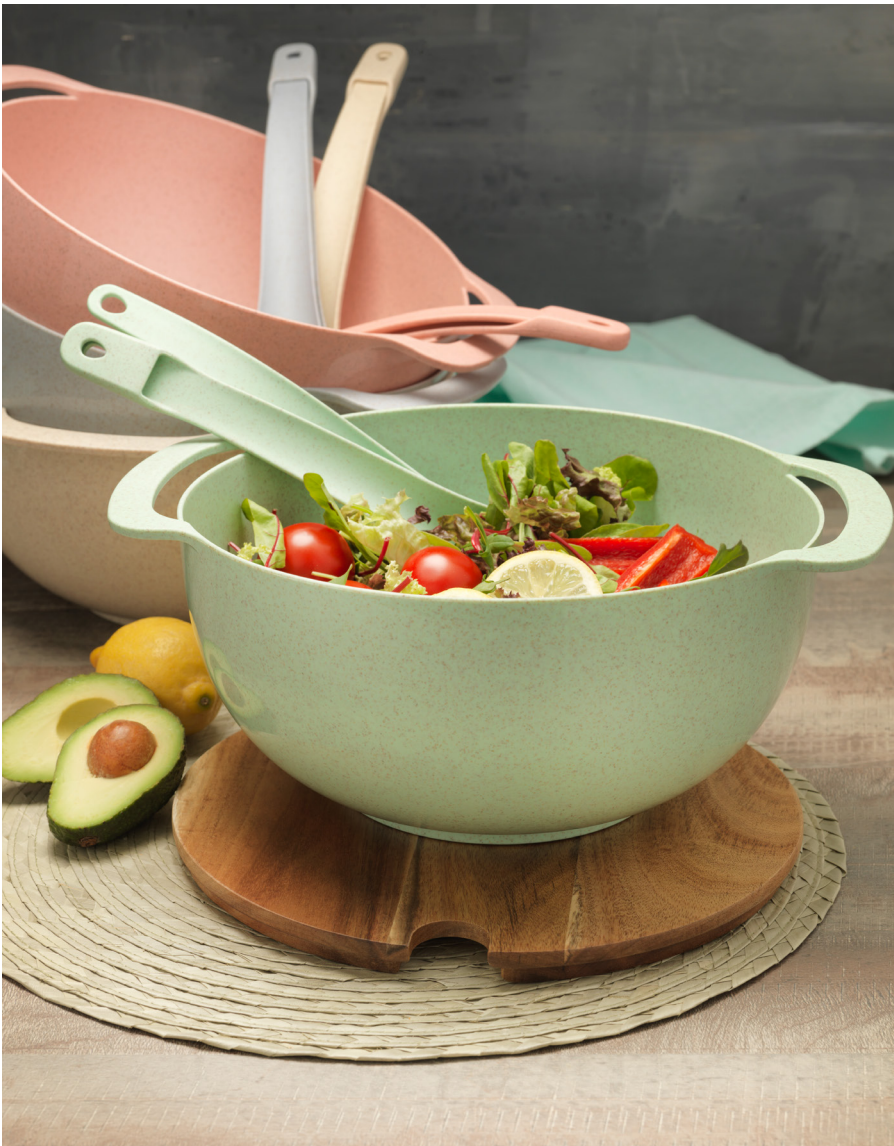
112993 LUCHA WHEAT STRAW SALAD BOWL WITH SERVERS