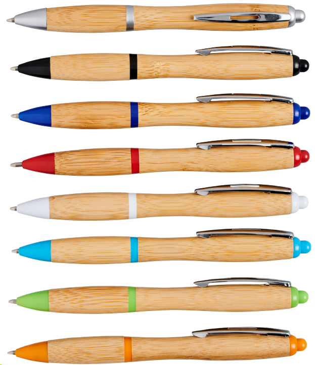
107378 NASH BAMBOO BALLPOINT PEN