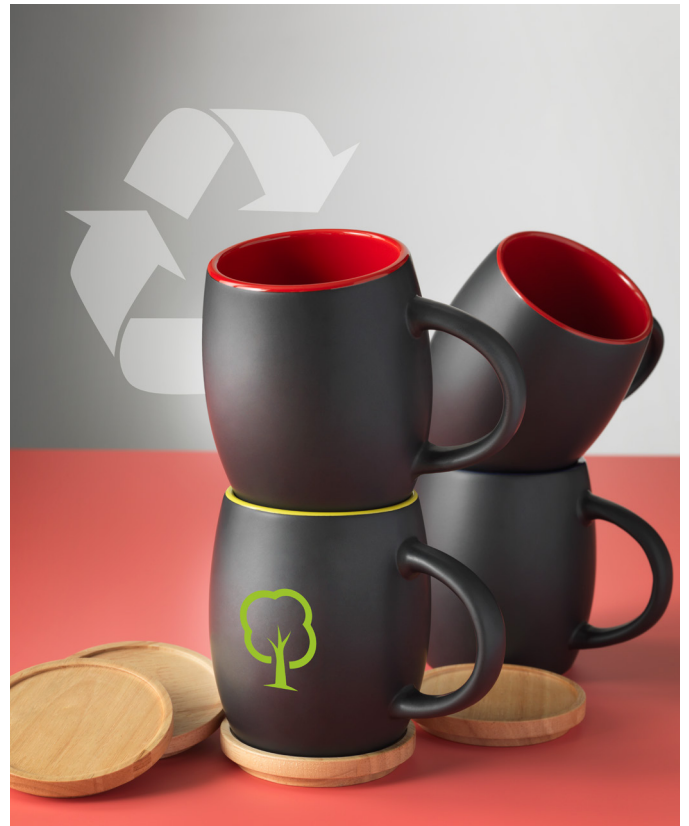
100466 HEARTH 400 ML CERAMIC MUG WITH WOODEN LID/COASTER