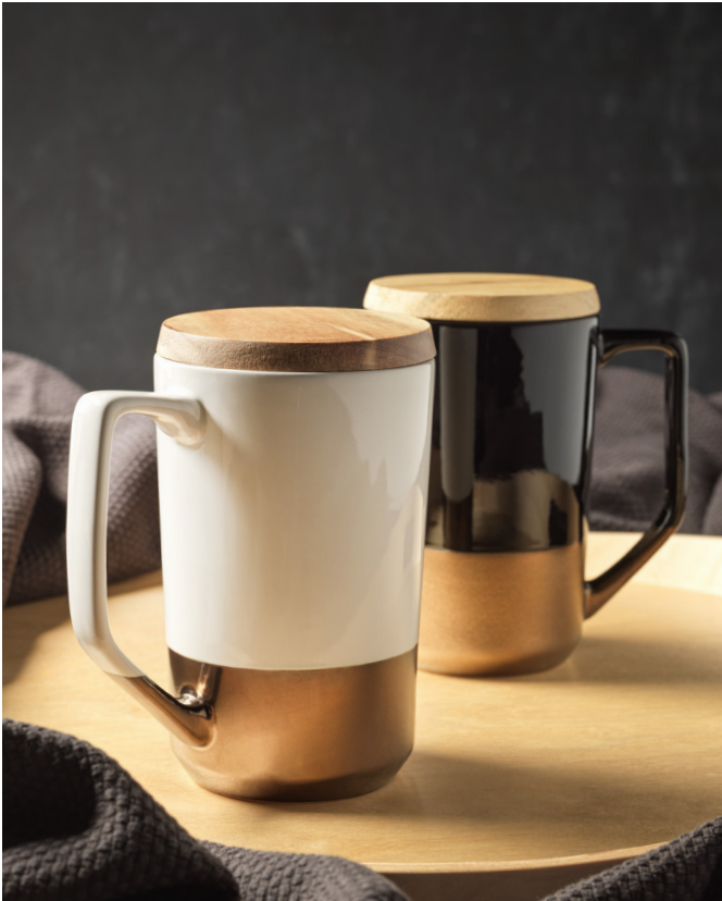
100537 TAHOE 470 ML CERAMIC MUG WITH WOODEN LID