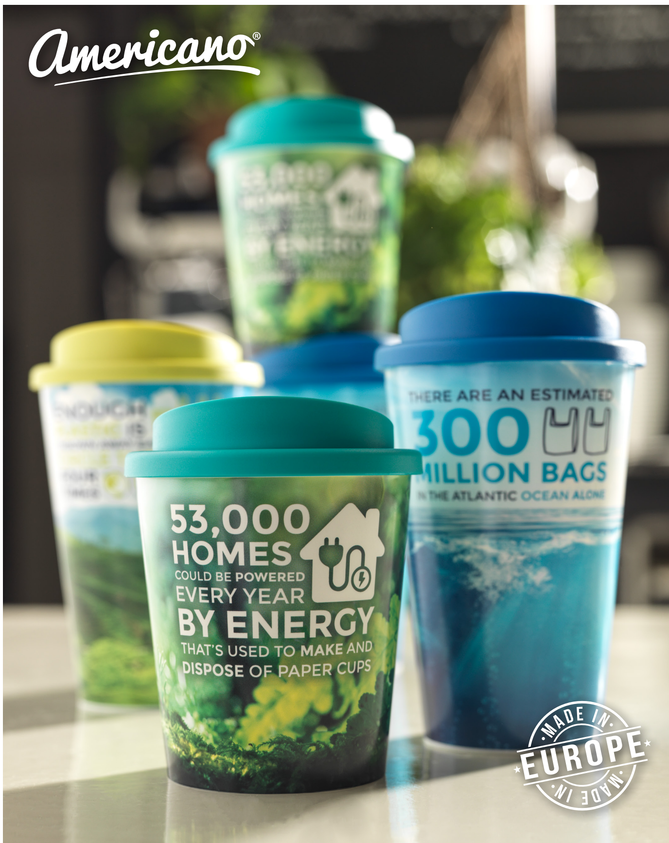
210091 BRITE-AMERICANO® ESPRESSO 250ML INSULATED TUMBLER