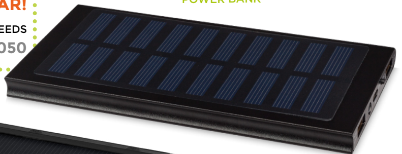
123688 STELLAR 8000MAH SOLAR POWER BANK

THE WHOLE WORLD COULD GET ALL THE POWER IT NEEDS FROM RENEWABLE RESOURCES BY 2050