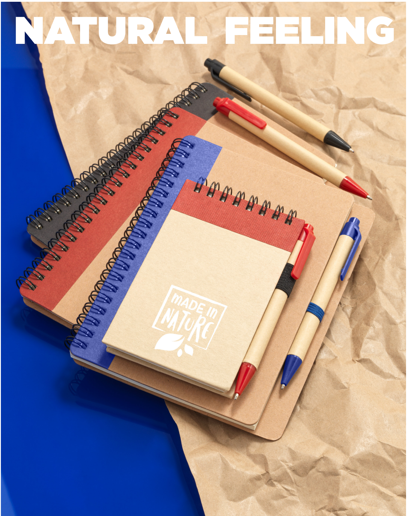
106268 PRIESTLY RECYCLED NOTEBOOK WITH PEN