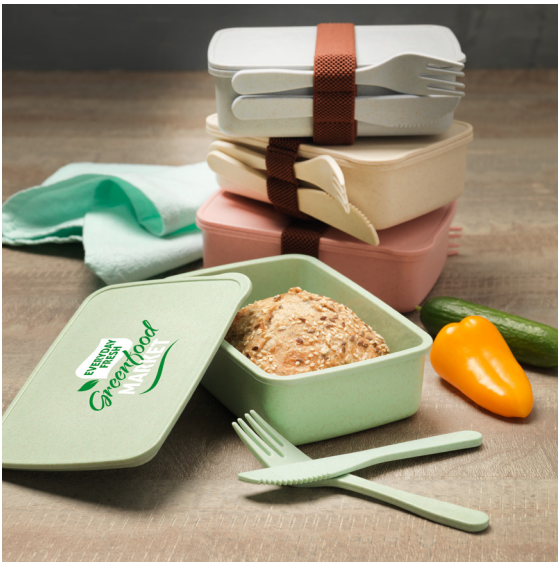
112986 BAMBERG BAMBOO FIBER LUNCHBOX