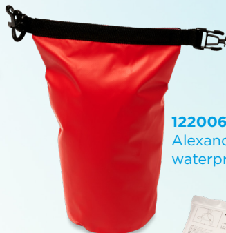
122006 Alexander 30-piece first aid waterproof bag