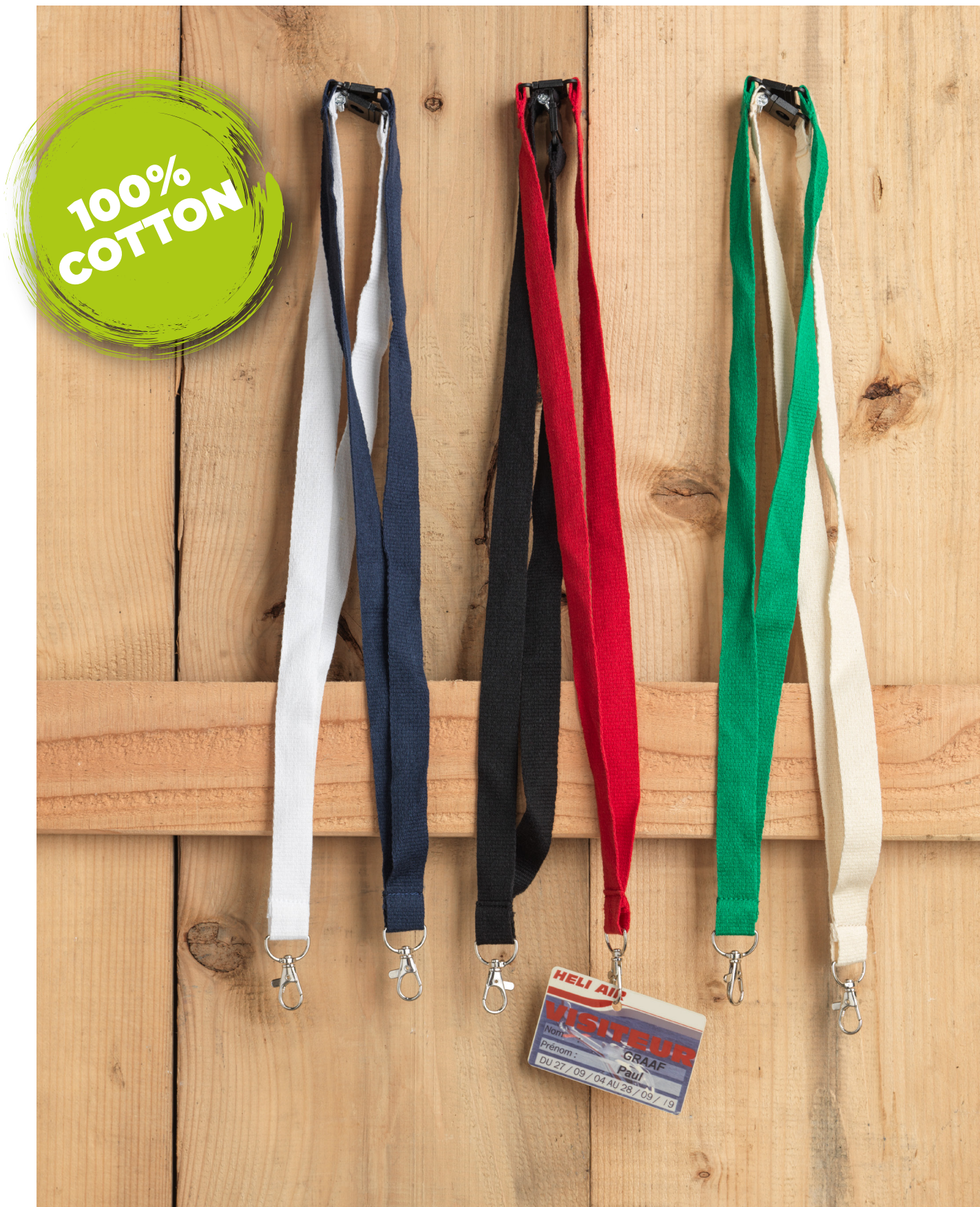
102512 DYLAN COTTON LANYARD WITH SAFETY CLIP