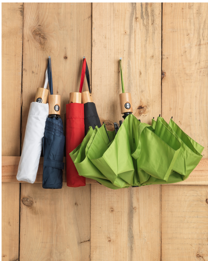
109143 RPET FOLDING UMBRELLA