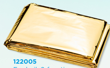
122005 Frederik 2-function emergency blanket