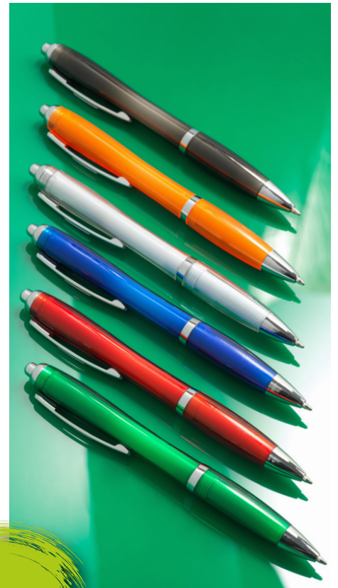
107377 NASH RECYCLED PET BALLPOINT PEN