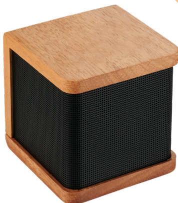
108304 SENECA WOODEN BLUETOOTH® SPEAKER