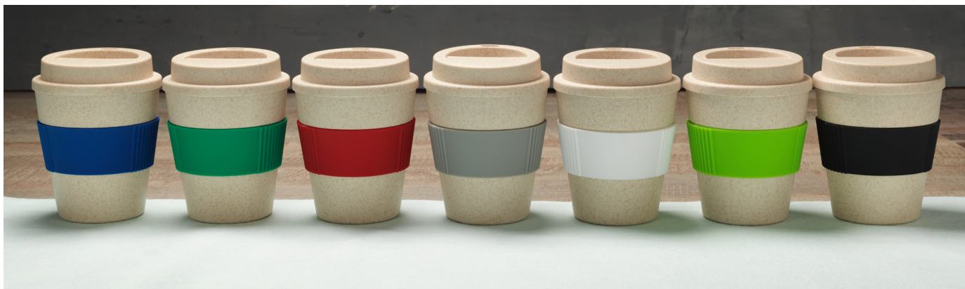
100576 OKA 350ML WHEAT STRAW TUMBLER