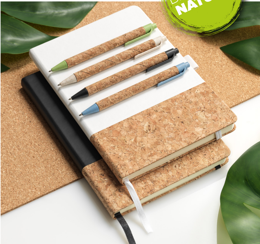
107385 MIDAR CORK AND WHEAT STRAW BALLPOINT PEN