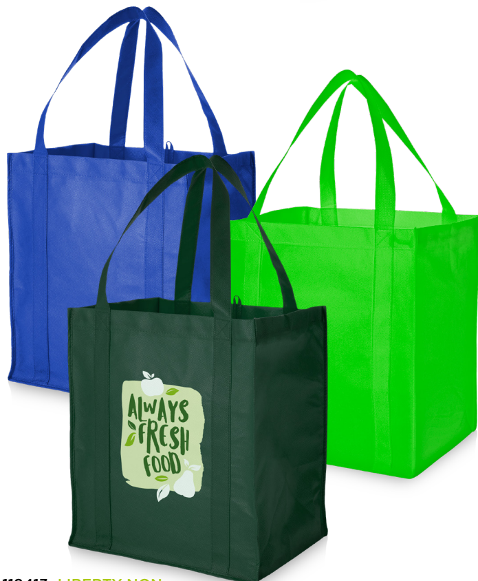
119413 LIBERTY NON WOVEN TOTE