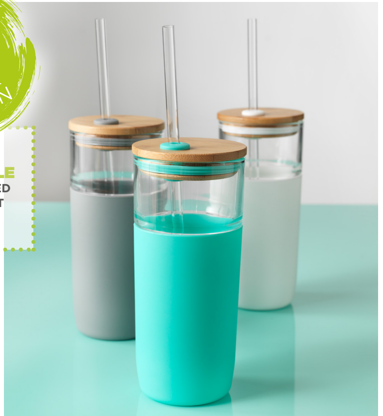
100486 ARLO 600 ML GLASS TUMBLER WITH BAMBOO LID