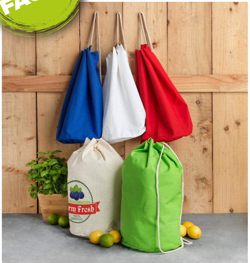
120111 MISSOURI COTTON SAILOR BAG

ROUGHLY 1.6 POUNDS OF OTHER USEFUL PRODUCTS BEING CREATED