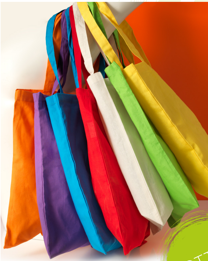
120181 MADRAS 140 G/M 2 COTTON TOTE