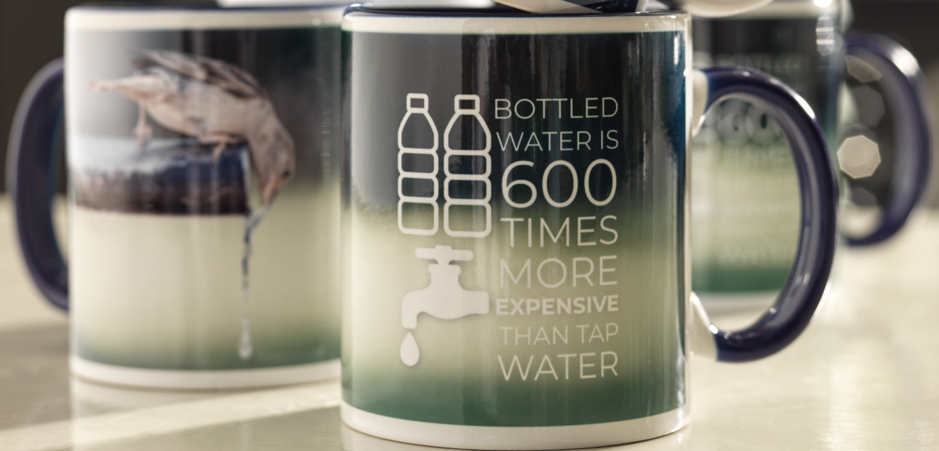
100377 PIX 330 ML CERAMIC SUBLIMATION MUG