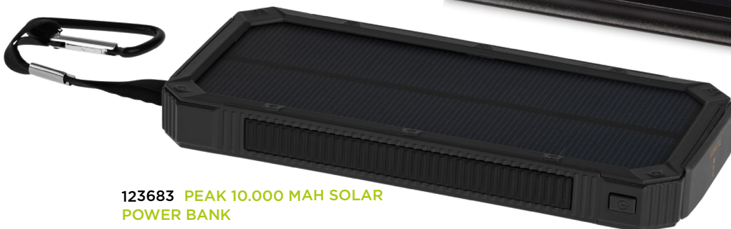
123683 PEAK 10.000 MAH SOLAR POWER BANK