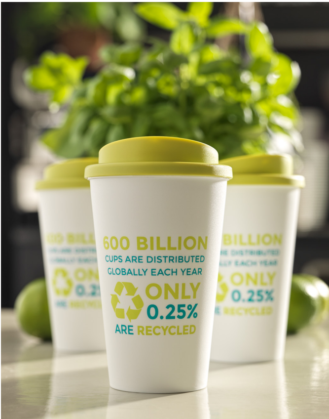
210001 AMERICANO® 350 ML INSULATED TUMBLER