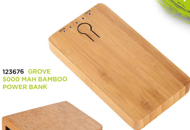
123676 GROVE 5000 MAH BAMBOO POWER BANK