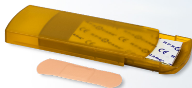
122004 Christian 5-piece plaster box