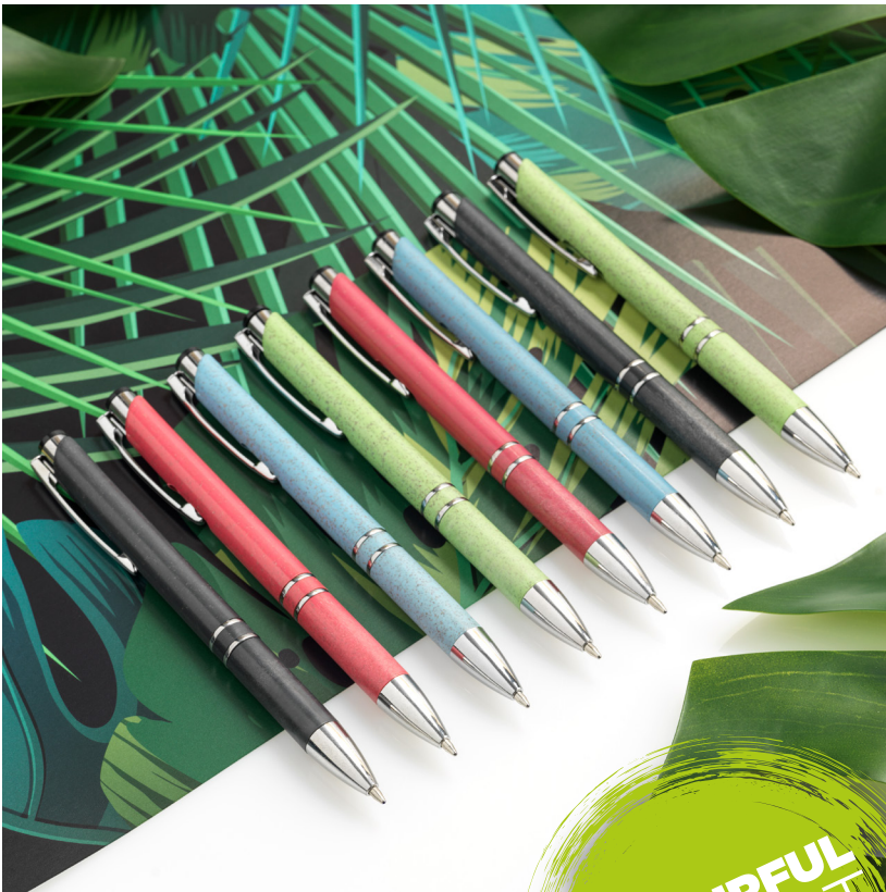
107382 MONETA WHEAT STRAW BALLPOINT PEN