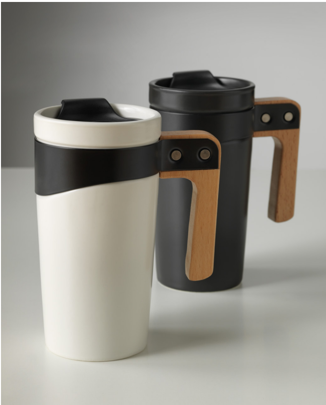
100430 GROTTA 475 ML CERAMIC MUG