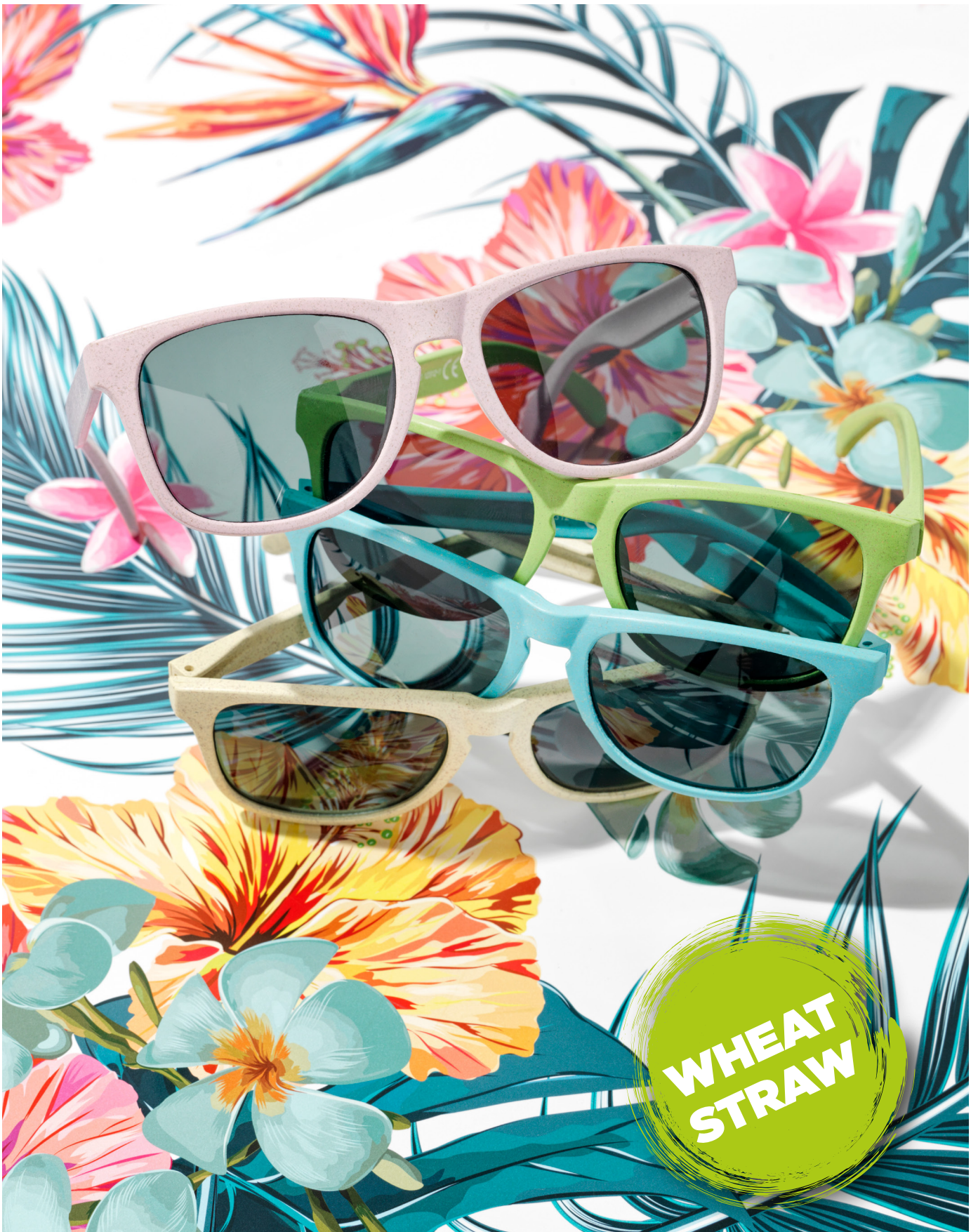
101001 RONGO WHEAT STRAW SUNGLASSES