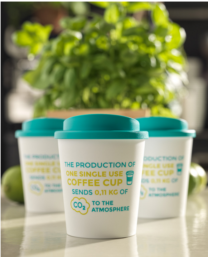
210092 AMERICANO® ESPRESSO 250 ML INSULATED TUMBLER