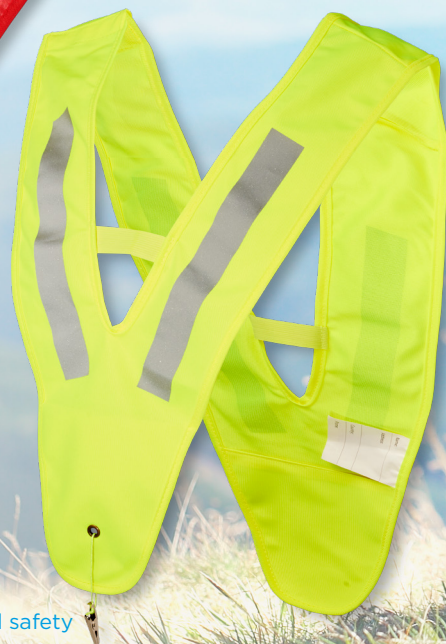
122015 Nikolai v-shaped safety vest for kids