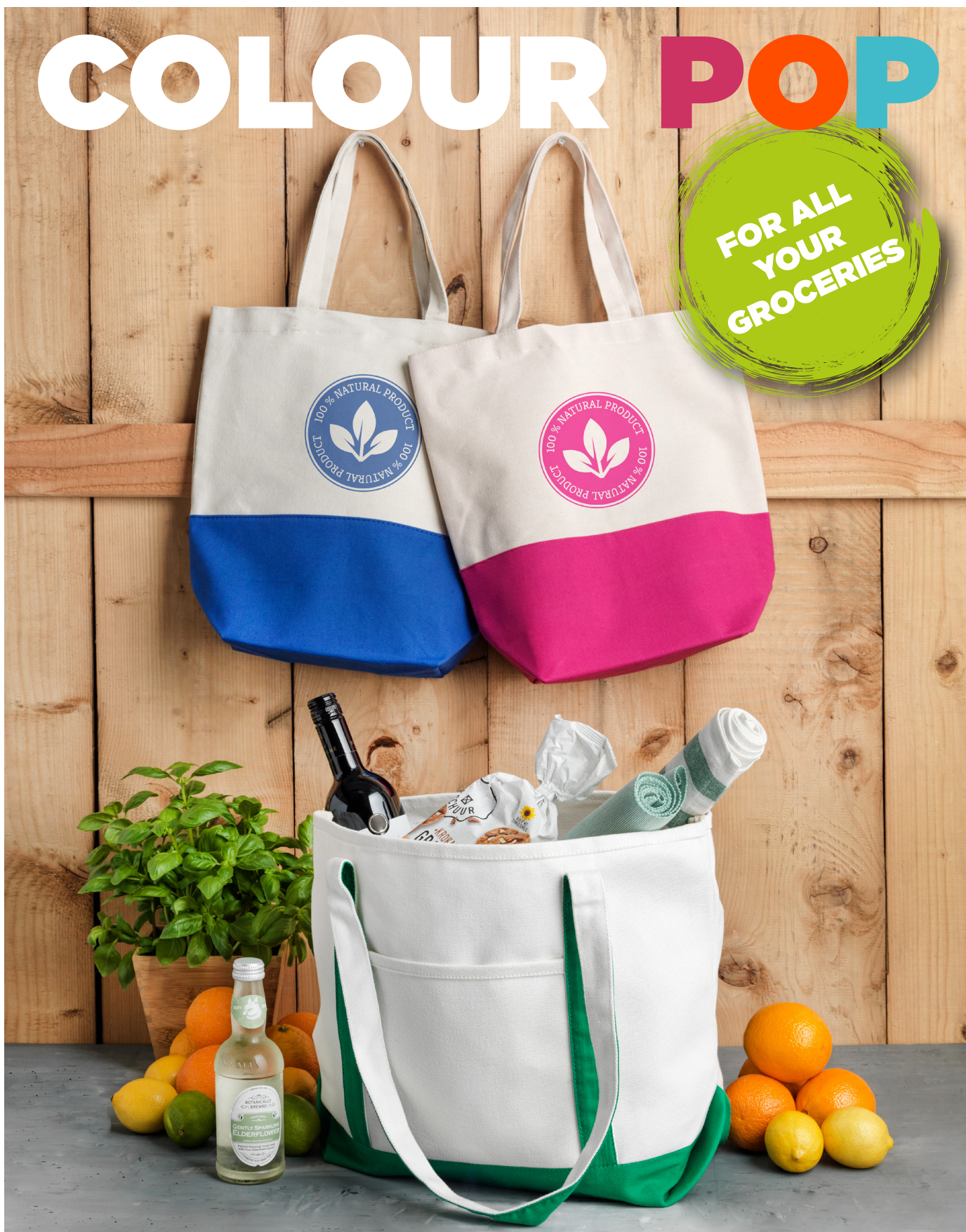
120258 COLOUR POP 284 G/M 2 COTTON TOTE