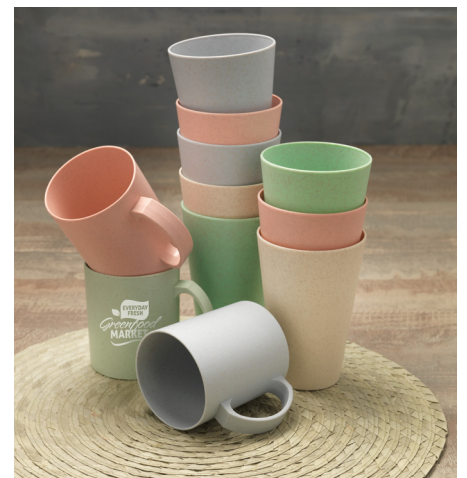
100615 GILA 430ML WHEAT STRAW TUMBLER