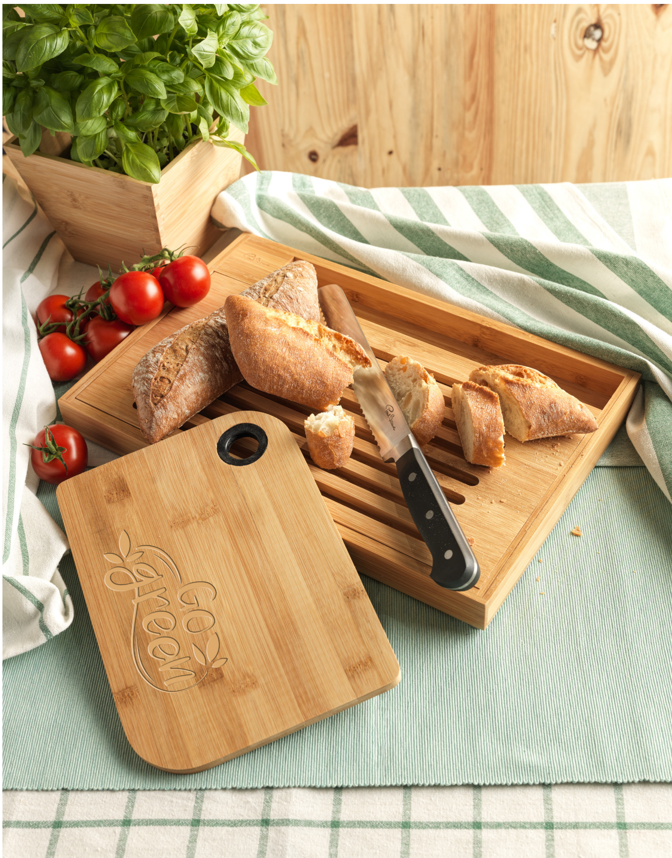
112873 MAIN WOODEN CUTTING BOARD