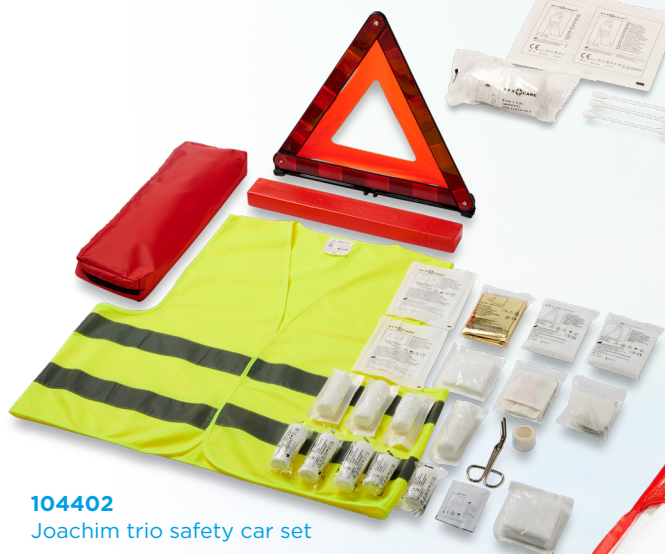
104402 Joachim trio safety car set