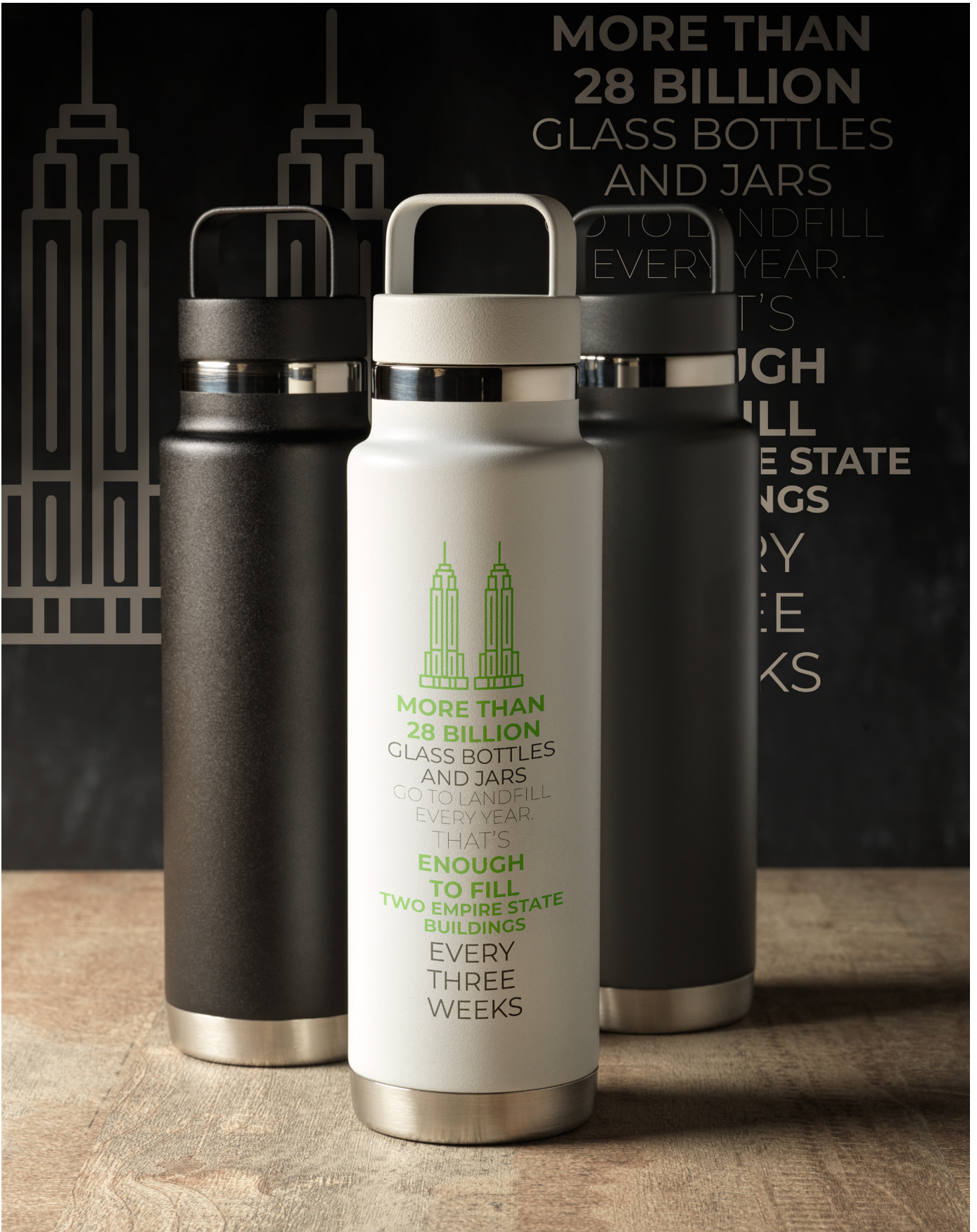
100590 COLTON 600 ML COPPER VACUUM INSULATED SPORT BOTTLE