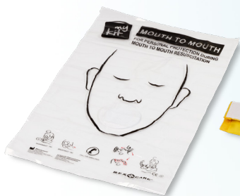
122010 Henrik mouth-to-mouth shield in polyester pouch