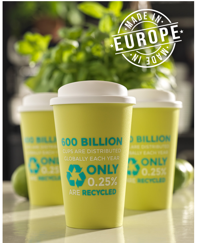
210001 AMERICANO® 350 ML INSULATED TUMBLER