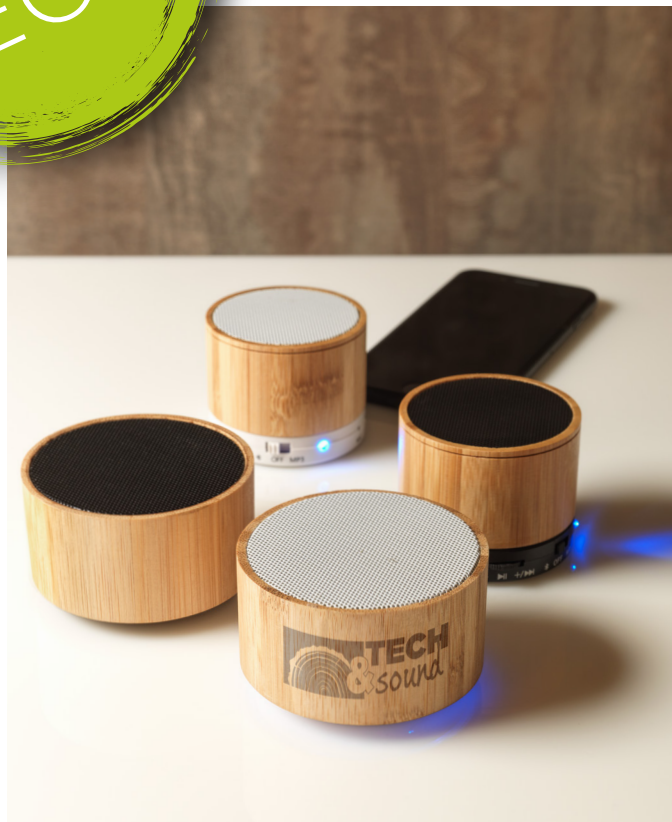
124100 COSMOS BAMBOO BLUETOOTH® SPEAKER 124101 EARTH BAMBOO BLUETOOTH® SPEAKER