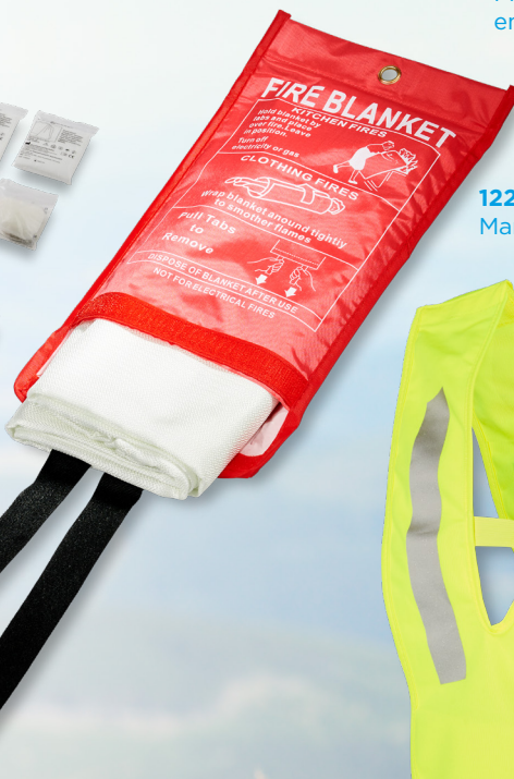
122003 Margrethe emergency fire blanket