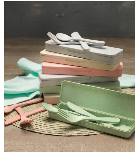
112996 BAMBERG BAMBOO FIBER CUTLERY SET