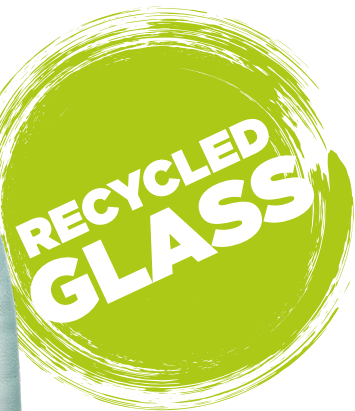
112691 RECYCLED CARAFE