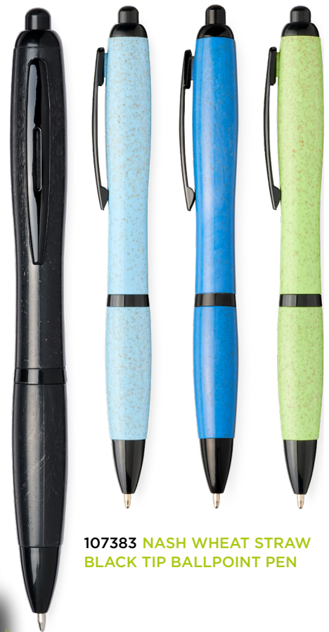
107383 NASH WHEAT STRAW BLACK TIP BALLPOINT PEN