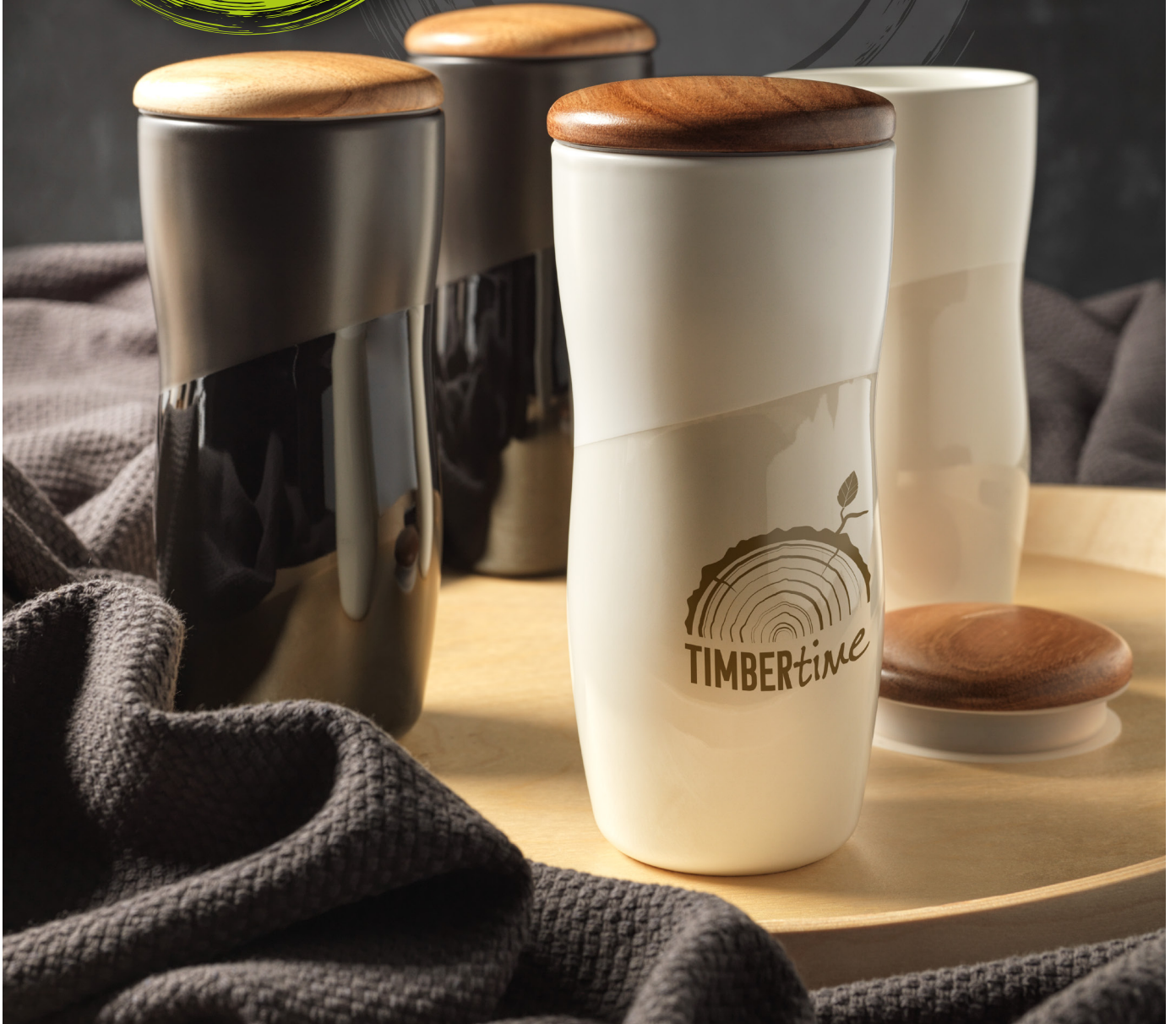
100592 RENO 370 ML DOUBLE-WALLED CERAMIC TUMBLER