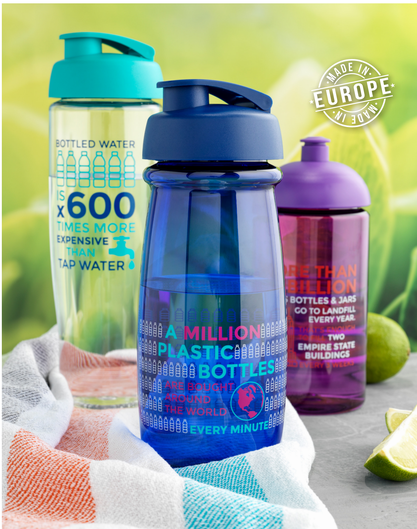
210040 H2O TEMPO® 700 ML FLIP LID SPORT BOTTLE