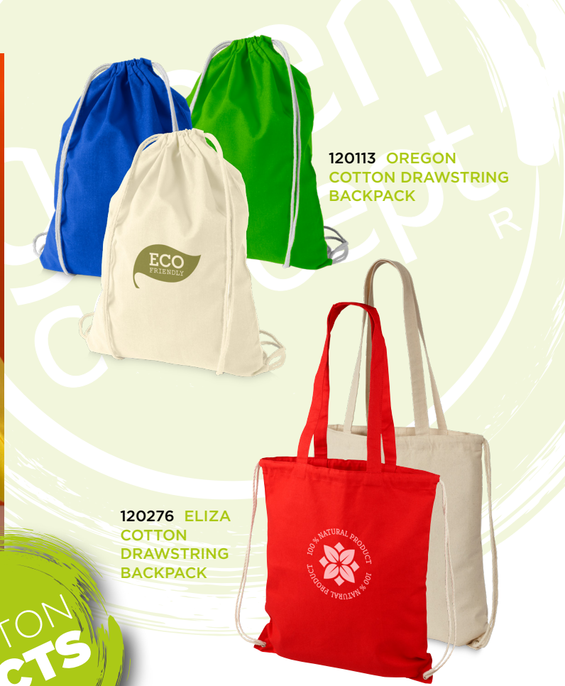
120113 OREGON COTTON DRAWSTRING BACKPACK