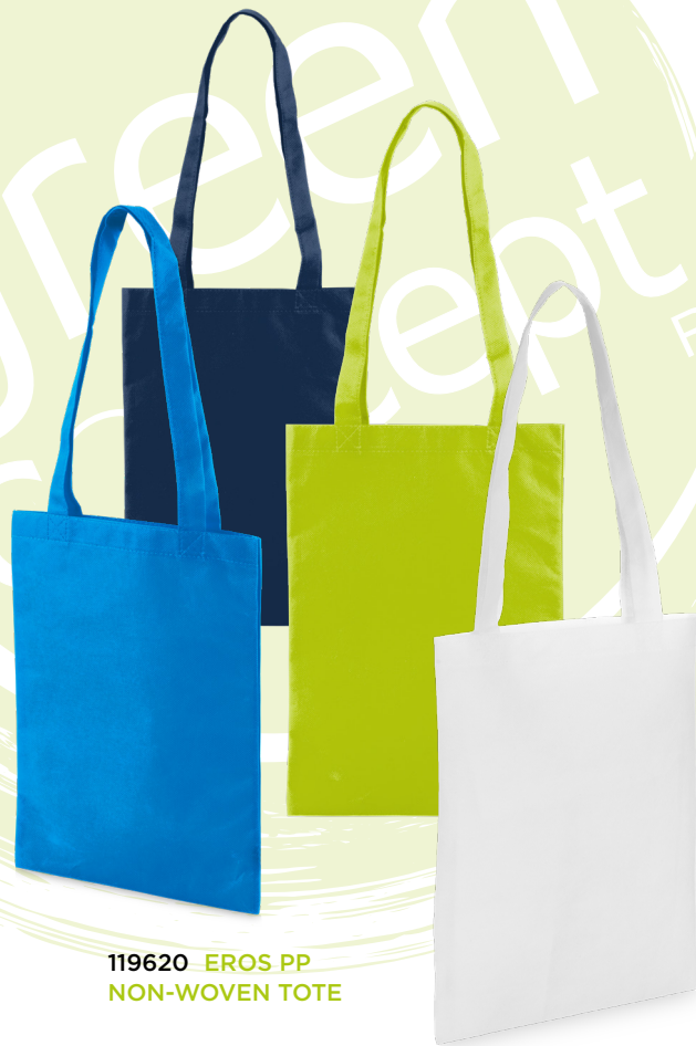
119620 EROS PP NON-WOVEN TOTE