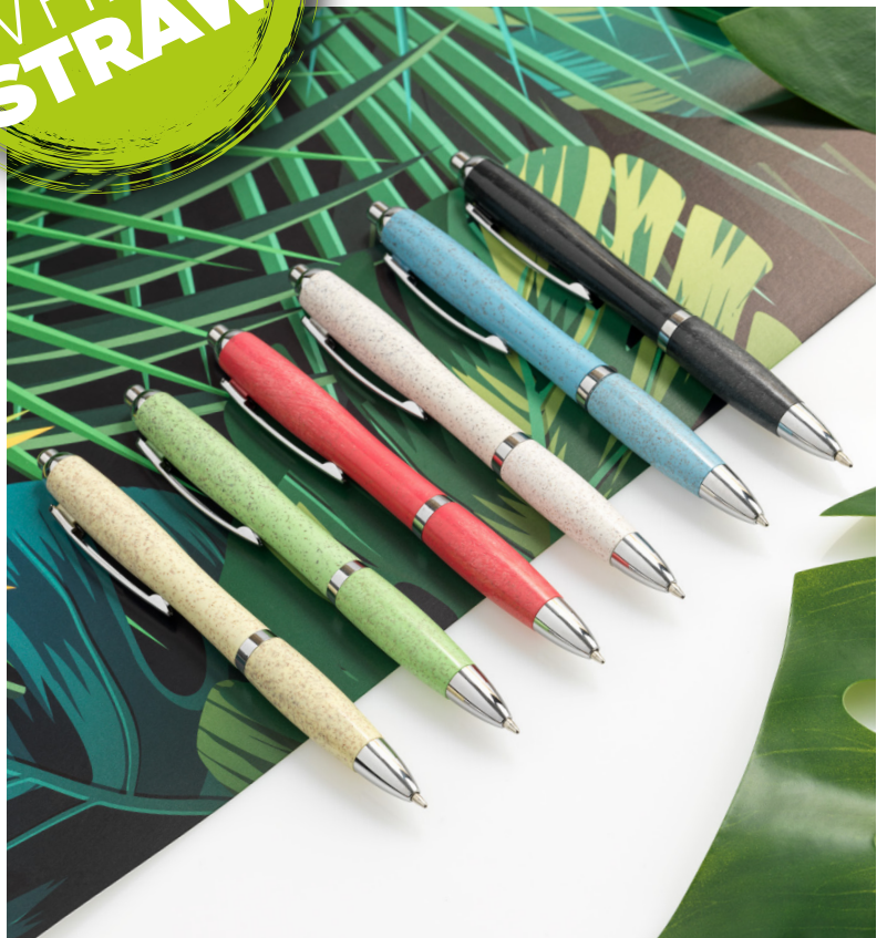
107379 NASH WHEAT STRAW CHROME TIP BALLPOINT PEN

WHEAT STRAW IS THE LEFT OVER STALK AFTER WHEAT GRAINS ARE HARVESTED, WHICH REDUCES THE AMOUNT OF PLASTIC USED BY AROUND 50%