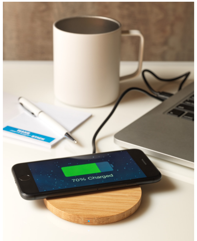
124105 ESSENCE BAMBOO WIRELESS CHARGING PAD