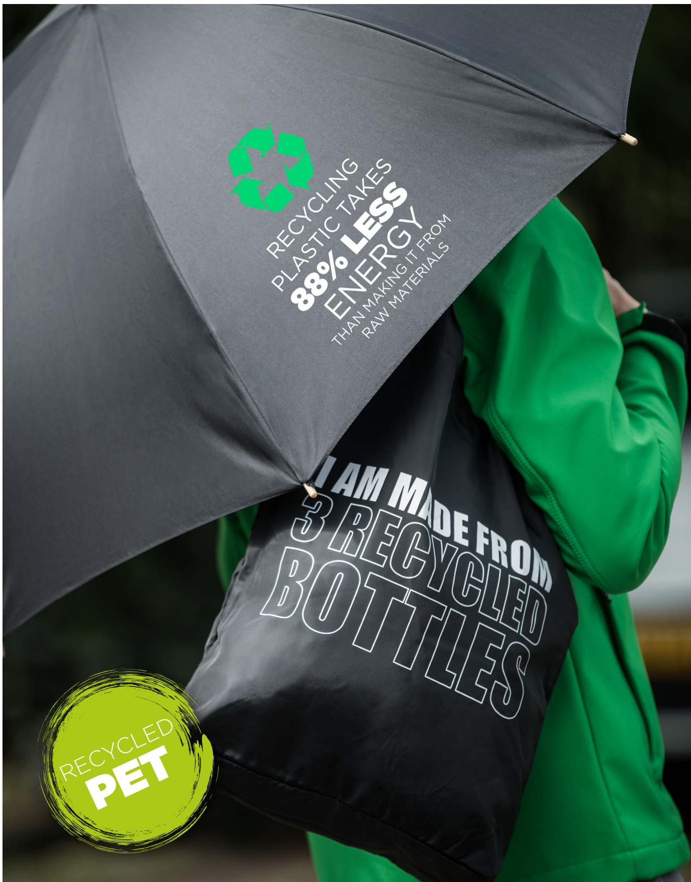
109400 RPET STRAIGHT UMBRELLA