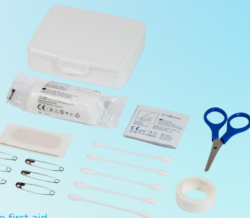
122007 Frederik 24-piece first aid plastic case