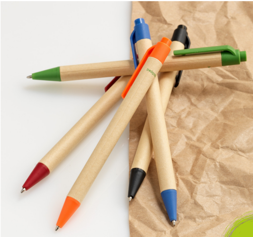
107384 BERKAN RECYCLED CARTON AND CORN BALLPOINT PEN