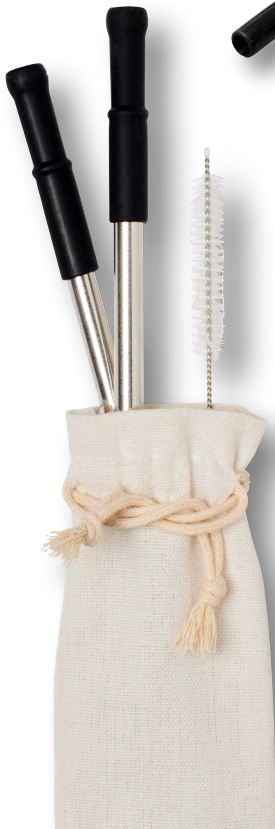
100574 LENA REUSABLE STAINLESS STRAW SET