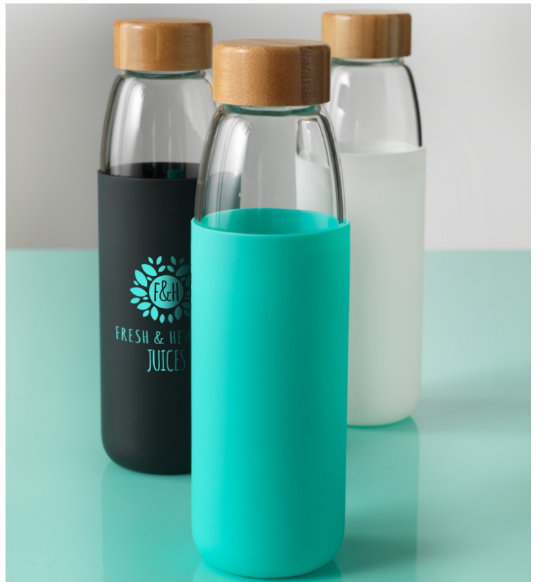
100550 KAI 540 ML GLASS SPORT BOTTLE WITH WOOD LID