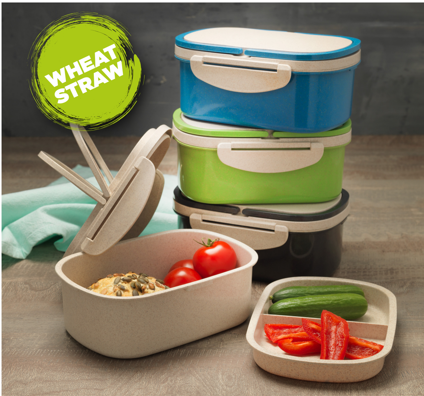
112994 CRAVE WHEAT STRAW LUNCHBOX